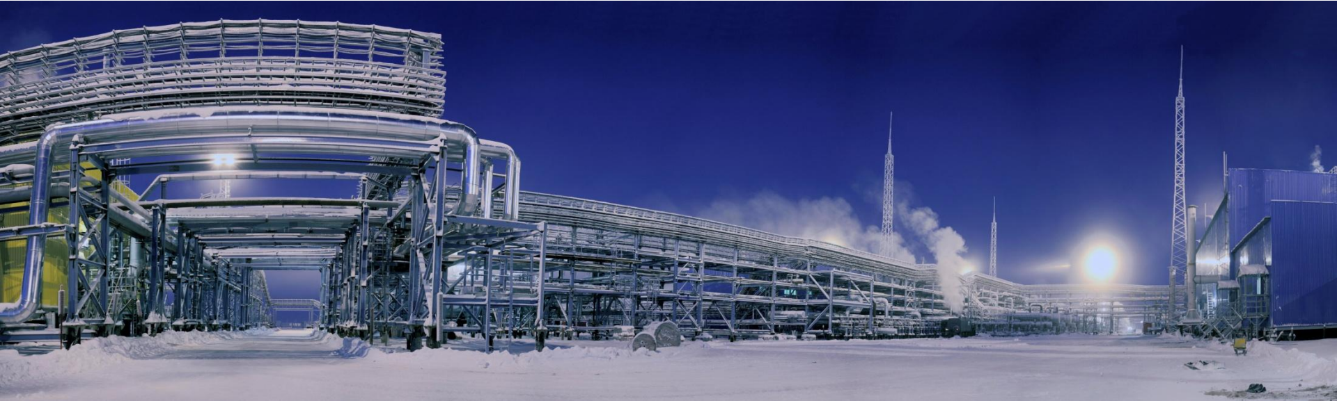
Pilot entry under Polar Circle. 1982